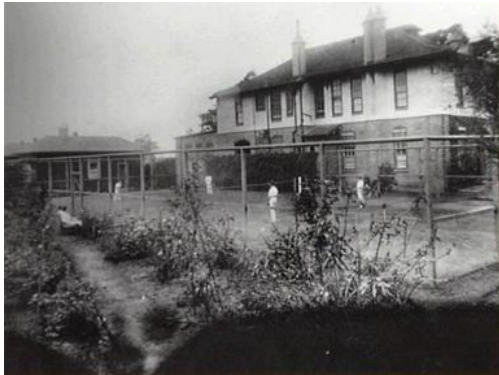
Tennis courts at rear of house PW 6537/6537992