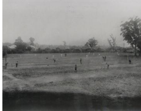
MHS looking toward Nelson St. PW 001/001380 c.1910