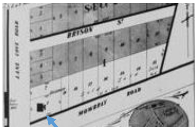
'Belrose' Cnr. Mowbray Rd & Gordon Rd PW 0010/0010187 Fig. 1