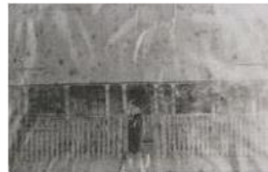
Bryson's 'Belrose' PW 003/003989 Fig. 2

Cove Rd (Pacific Highway). [Forsyth, L.C. (1987), Willoughby and Lane Cove 1865 – 1895]. Also, it appears that the first schooling in the Parish of Willoughby was located on this site. 1