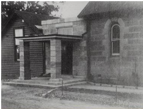
Classroom between the 'Chapel' (shown on right) and the main school building to the west. PW 6536/6536545