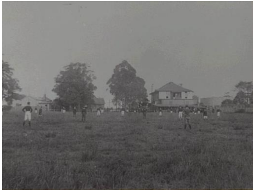
Playing fields behind the school PW 6537/6537997