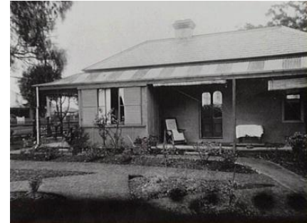
'Penzance' n.d Cnr. Mowbray Rd & Orcard RD PW 6536/6536528 Fig. 9

The site of what was to become Mowbray House School is shown in the accompanying diagram. We know that the School of Arts/Council Chambers that was removed to Beaconsfield Rd was to the east of 'The School'. This leaves the area between 'The School' and where 'Belrose' stood. It is clear in many photographs looking toward Nelson St there were substantial playing fields behind and next to the school. So it appears the school site