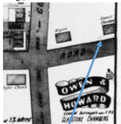
Council Chambers 1895