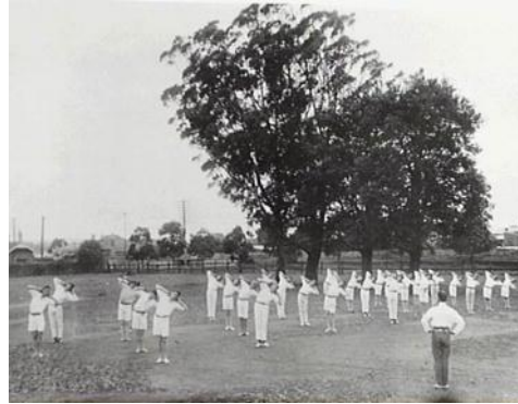
Exercise yards of the Mowbray House School PW 6538/6538373