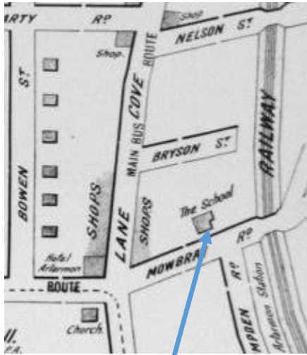
Mowbray House School site PW Fig. 8

The original structure on the site was Bryson's house 'Belrose' on the corner of Mowbray Rd and the current Pacific Highway (see Fig. 1). At the time the land on which 'Belrose' and Mowbray House its Chapel and Cottage sit appears in Fig.7