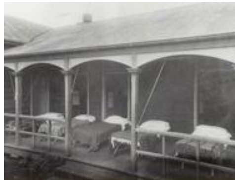
Master's Cottage with external boarder's dorm. PW 6536/6536532