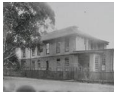
Mowbray House School 1930s

In 1906 the Chatswood Preparatory School opened in a new building next door to the old School of Arts building. In 1914, the name of the school was changed to Mowbray House School . The building is still standing opposite Hampden Rd. It is acknowledged by a Heritage Plaque in the footpath outside. The original School of Arts Building that had become the Council Chambers finally became the school chapel until it was removed to the corner of Dalrymple Ave and Beaconsfield Rd in 1957 to be used as the Holy Trinity Church.