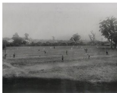
Chatswood Preparatory School c.1910

that the Government should place a sum of money of the estimates for the purpose of enabling the Professors of the University to visit the various Schools of Arts throughout the colony for the purpose of delivering lectures . [Source: Evening News, 1875 (May 12) p.2]. The School of Arts operated for two years. In 1877 Willoughby Municipal Council rented the building for use as Council Chambers. Council purchased the building in 1879 and it remained in use as Council Chambers until 1903. After the Council takeover of the building, the School of Arts became defunct, although the building itself continued to be known as the School of Arts. It was a fine sandstone building which in 1957 was moved to Beaconsfield Road to become the Church of the Holy Trinity after being used as a school chapel for a number of years.